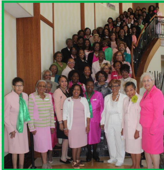
GDO Sorors Attended the Tidewater Cluster in Great Numbers