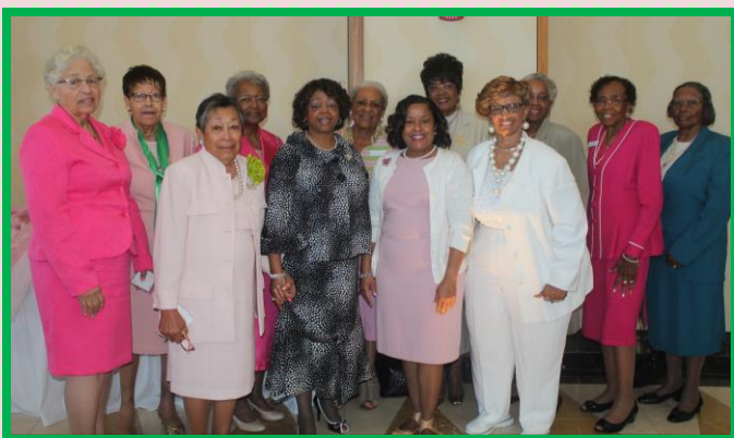
GDO Golden Sorors at Tidewater Cluster