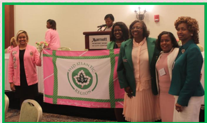
GDO ASCEND Program Recognized at Tidewater Cluster